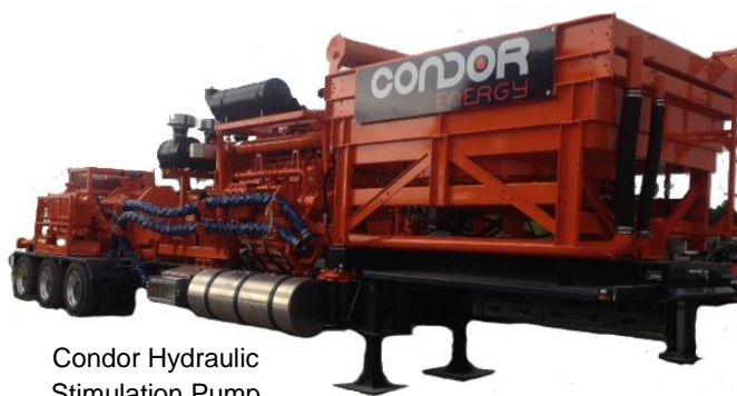
Condor Hydraulic Stimulation Pump

Condor Energy Services is a major partner of the Australian oil & gas industry and has extensive international experience combined with detailed local knowledge and with more than 100 years of combined operational experience in the international resource sector. The world-class team at Condor Energy Services possesses industry